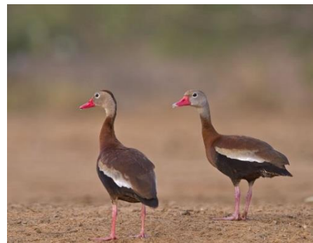
Black-tailed Whistling Duck