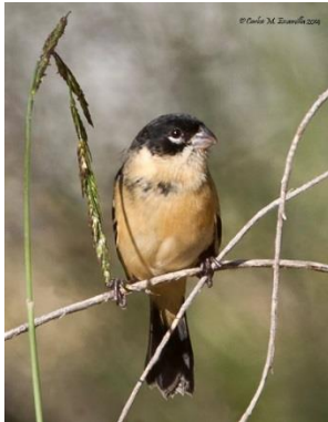
Morelet's Seedeater formerly known as White-collared Seedeater

To view more photos, please visit the Laredo Birding Festival and Monte Mucho Audbon Society Facebook pages, as well as laredobirdingfestival.org , allaboutbirds.org , ebird.org , birdsoftheworld.org , and facebook.com/raul.delaredo1 .